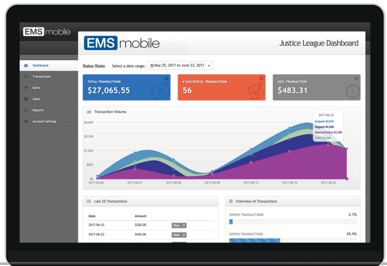
Back Office Portal

View all your past transactions in detail on your device including cash transactions. Here you can perform voids, refunds and re-send receipts to your customers. Signatures and receipts are stored for the lifetime of the account.